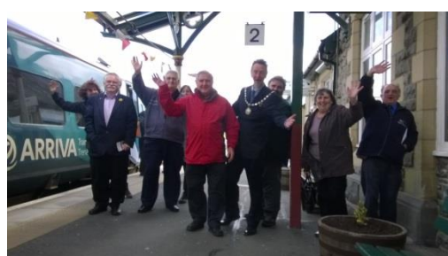
Members of Machynlleth Town Council greet the train at their station as it comes in.