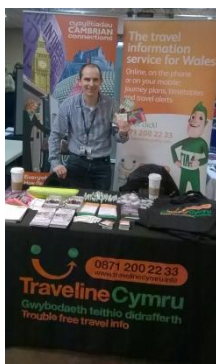
At the 'Re-Freshers' Fair, Aberystwyth University 2016.

Over the past year we taken many opportunities to 'sell ourselves'. We do this by distributing our publications to a wide range of places – from pubs to hotels to caravan parks to schools and places of work. We also visit various locations and events to take our own displays out to the people. This is an important part of what we do in that it gives us the opportunity to talk one to one with interested parties. The comments and conversations vary from discussions on the comfort of seats, to discussions on what to do on a day off by train, all the way to sometimes very intricate and complicated discussions on 'bull head rail' when