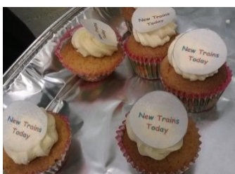
Cakes made by Welshpool Town Council and given to passengers on the first day of new services!

As a member of this group the partnership is being given the opportunity to influence high level decisions for the benefit of rail users on the Cambrian, and the opportunity to engage closely with the Minister and her senior civil servants on other issues.