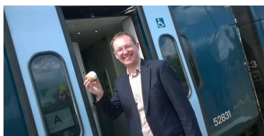
Russel George AM for Montgomeryshire grabs a commemorative cupcake at Welshpool