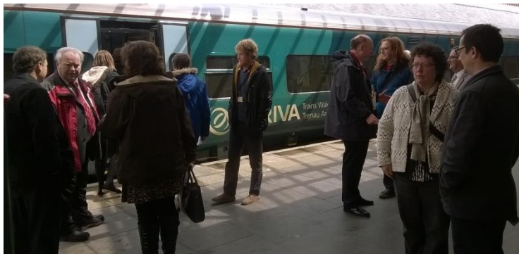
Elin Jones AM looks on as an excitable crowd gathers at Aberystwyth for the first ever departure of a 1230 service from the station in recent times.

In the first 6 months since the introduction of the additional services, which were supported by 2 mini-PR-campaigns from the Cambrian Railways Partnership, initial results from a further survey undertaken by the Implementation Group suggest and increase in passenger numbers of around 40% - a staggeringly positive outcome for all involved.