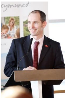
Hosting the first Wales & Borders franchise specification seminar for Rail Interest Groups – May 11 th , 2015, City Hall, Cardiff.

Since the establishment of the Mid Wales Rail Implementation Groups, both on the Cambrian and Heart of Wales lines, we have enjoyed a far more productive relationship with our colleagues at Welsh Government which has led to far more opportunities being presented to us on the Cambrian and on the other community rail lines in Wales.